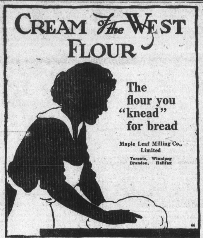
You can procure Cream of the West Flour from the Watford Farmers' Co-operative Association, Limited.

is all fresh, flavoury young leaves that yield generously in the teapot. Always reliable.