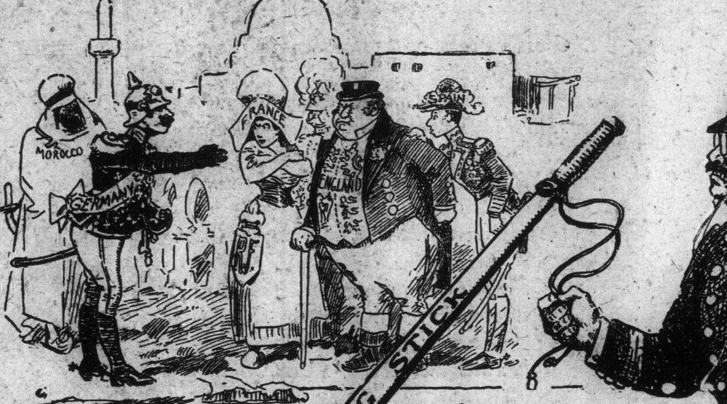
THE SITUATION AT ALGECIRAS.