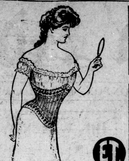
EMPIRE STRIVE—A girle made of satteen cloth, perfect fitting, new-est-modeling. Price $1.00.

OTTAWA'S PHONE RATES. Ottawa, April 28.—The special telephone committee of the city council tonight, decided by a vote of 2 to 1 to recommend the council to give the