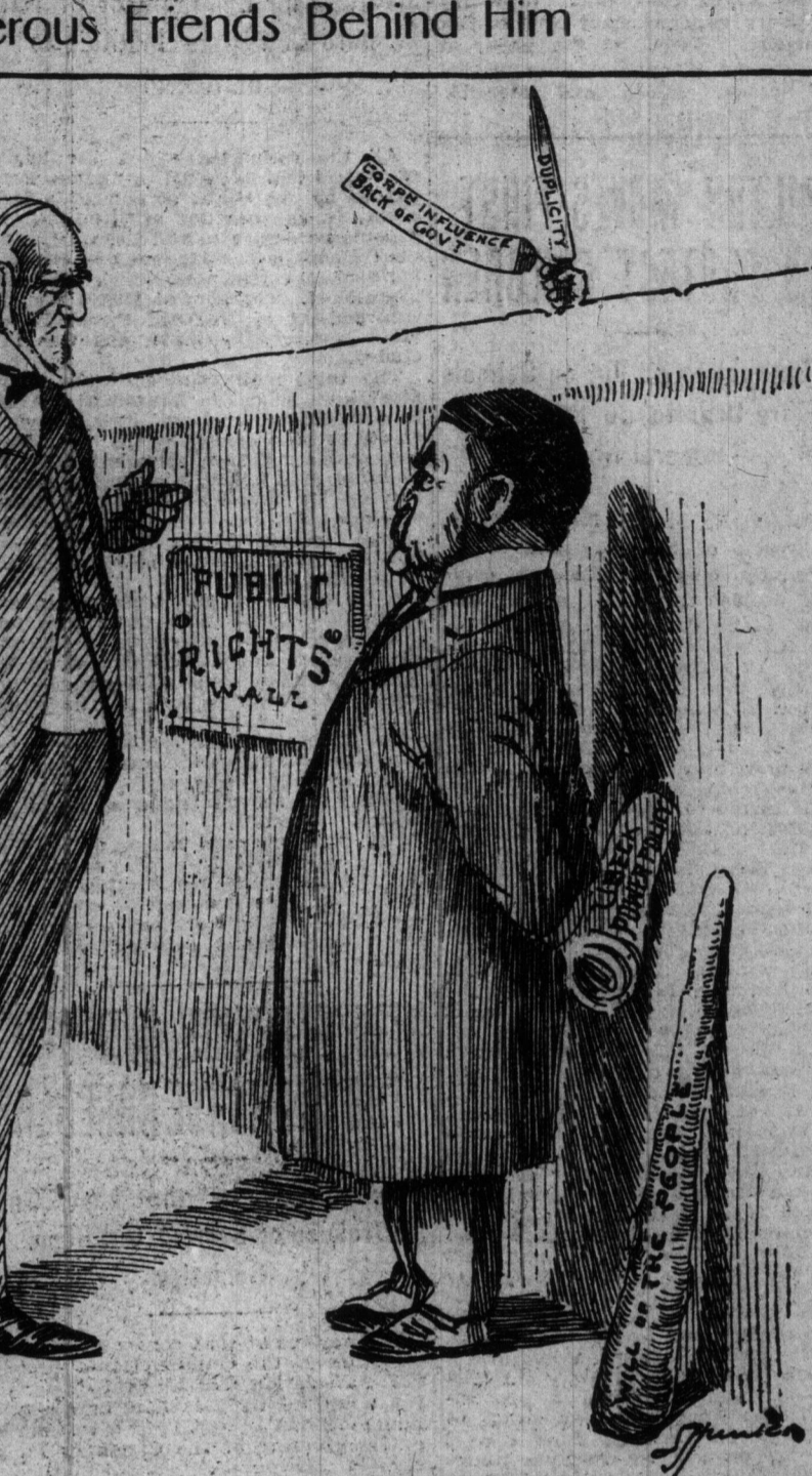
OLD MAN ONTARIO: Back closer to the wall, my friend, if you would avoid a knife in the back.