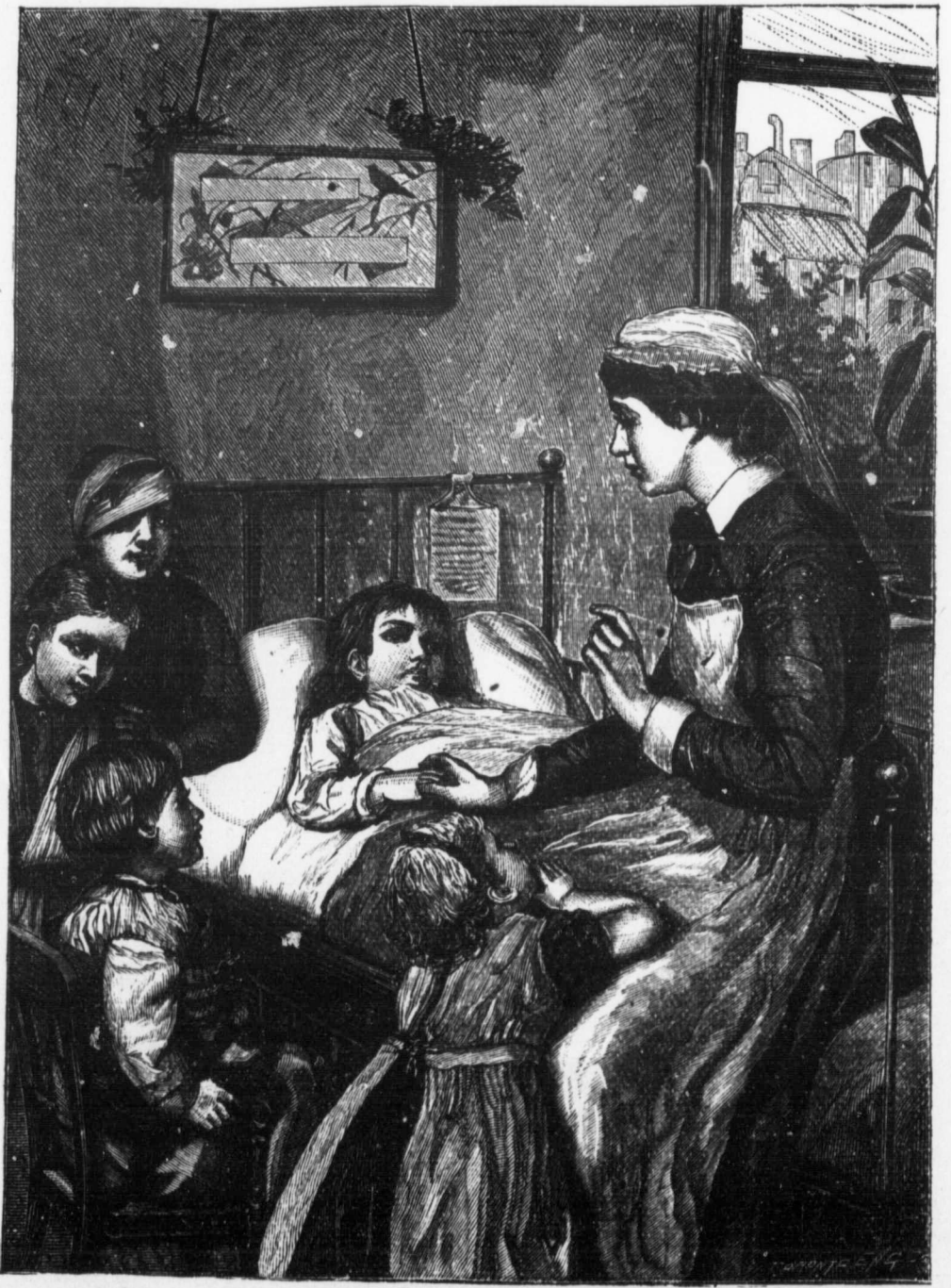
"CANADIAN CHILDREN'S COT."