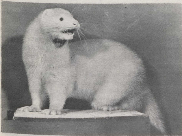
A pearl male mink

The wild variety is found in many countries, but the North American type is considered the most