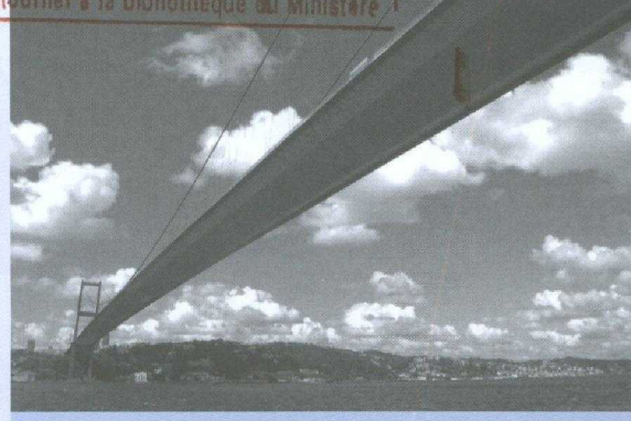
Bridge over the Bosphorus, Istanbul.

Return to Departmental Library Irner à la bibliothèque du Ministère