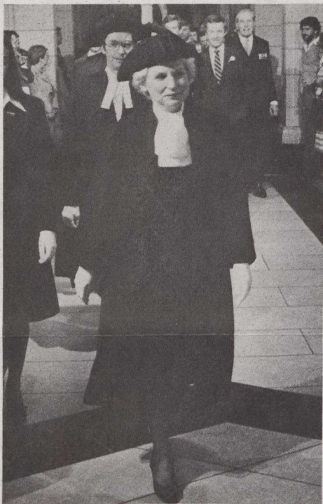
Jeanne Sauvé, the first woman speaker of the House of Commons, leads members of Parliament into the Senate.

In co-operation with provincial governments, other steps will be taken to encourage more rapid substitution from oil to other energy sources in order to substantially reduce the significance of oil in meeting our energy needs. Policies will be introduced to encourage consumers to switch from oil to natural gas or electricity for home heating. My Government equally favours the earliest possible construction of a natural gas pipeline to Quebec City and the Maritime Provinces, and awaits with interest the report of the