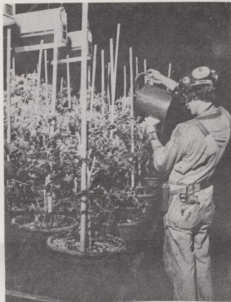
Growing mine-shaft vegetables.

The agricultural department of Inco Metal Company is scheduled this spring to begin assessment of a prototype greenhouse at their Copper Cliff south mine, three miles west of Sudbury, which has been turning out tomatoes, English cucumbers, leaf lettuce, spinach and bedding plants for the past year with the help of exhaust heat from the mine's ventilation system.