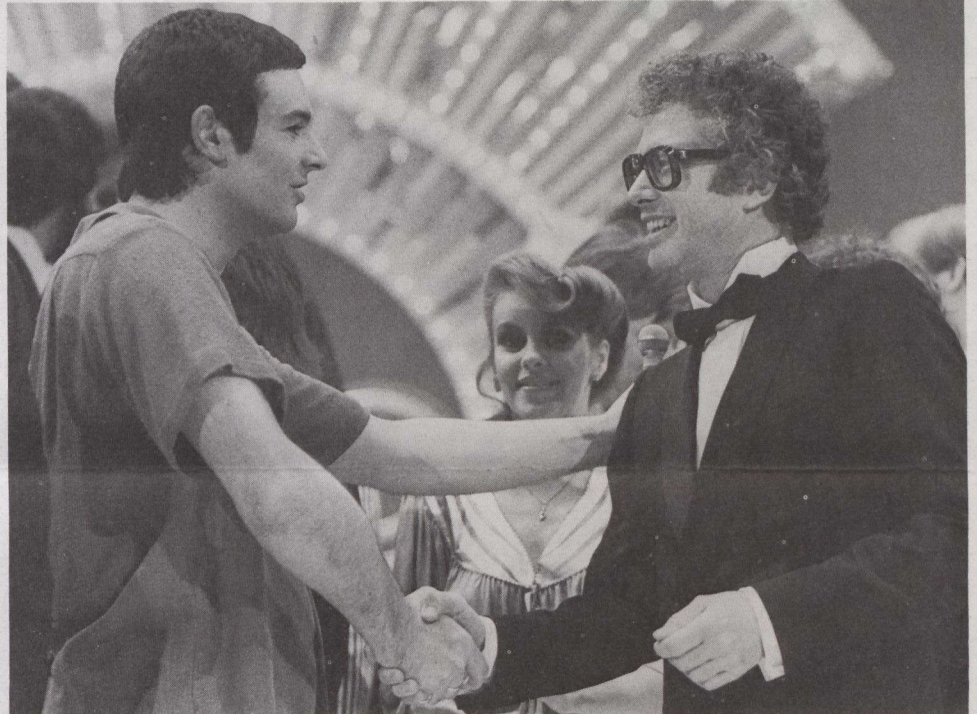
Ambassador Ken Taylor presents Juno to singer Burton Cummings.