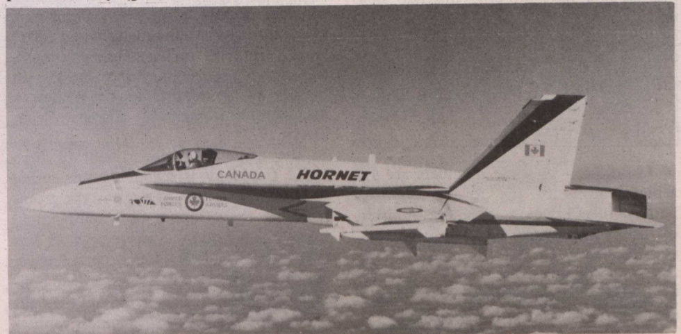
The Canadian Government's choice was the McDonnell Douglas CF-18A.