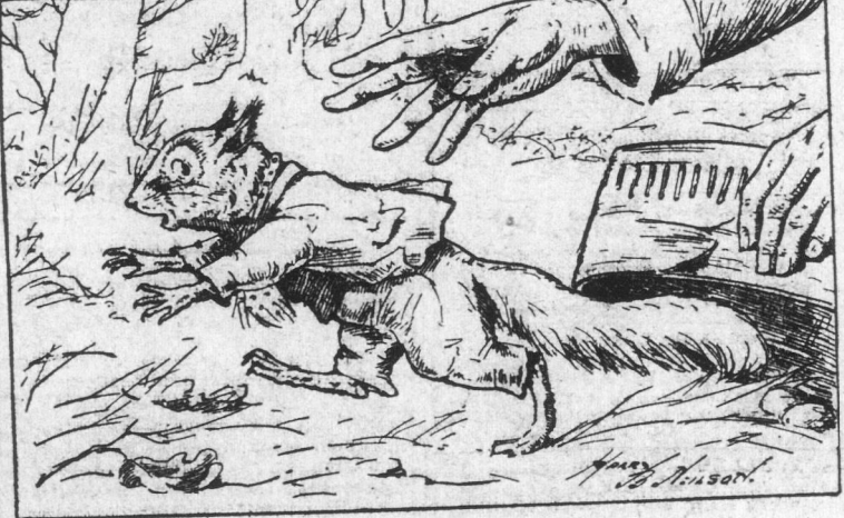
"With a wild dash he was free."

"Fear not, and hold up your tail like a man," said one of the kindly old men, by the way, was only a kindly old man, and he was very old.