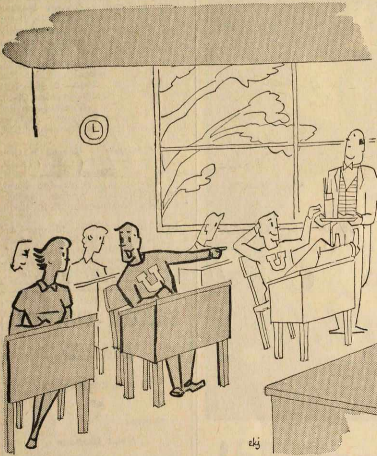
He says he does it by Steady Saving at the Bank of Montreal*

The theme for this year's ball will be "Fifty Years of Dentistry," in keeping with the Dalhousie School's Golden Jubilee. Tickets can be obtained from any Dental student; the price, $3.50.