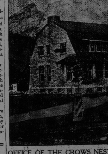
OFFICE OF THE CROWS NEST PASS COAL CO. ONE OF THE FEW BUILDINGS LEFT STANDING IN FERNIE.

Supplies Are Required and Money is Urgently Needed at Once—Six Thousand People are Homeless.