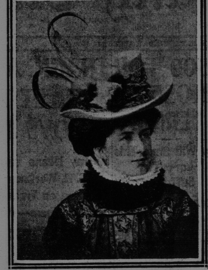
MAGPIE EFFECTS IN STREET NECKWEAR.

Black and white were never more popular than at present, and no article of feminine garb do they more readily lend themselves than to street neckwear.