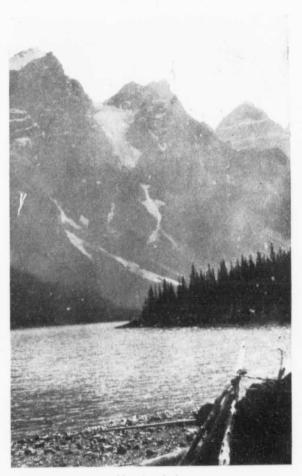
Moraine Lake "Snow lay almost at the base of its farther slope"

makes mines, they've mostly got to be underneath where they don't show.''