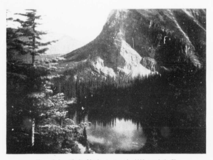
Mirror Lake-"In its fringing trees, quite hidden and aloof"

you know I don't believe I want to knit. I am going to take a chance on getting excited. It seems worth it. Did you ever see anything so faseinating as that tinted hill over there? And to think that I never realized before that B.C. wears colours! Somehow, I've always thought of her as elad in fadeless green; but out here she has taken to russet and wears red shoes.''