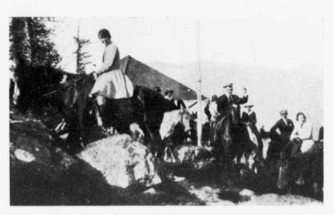
"The highest point on the Continent reachable by pony trail"

"What is this guide supposed to be-Swiss?"