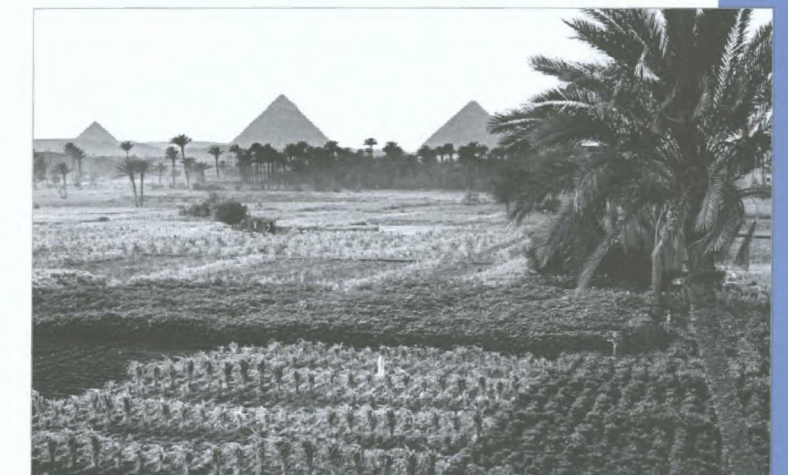
Parts of Egypt are fertile, but it still relies heavily on foreign food imports.

"The economic and social changes, not to mention the large tourist base, have led to an increase in demand for top-quality processed and semi-processed food products.