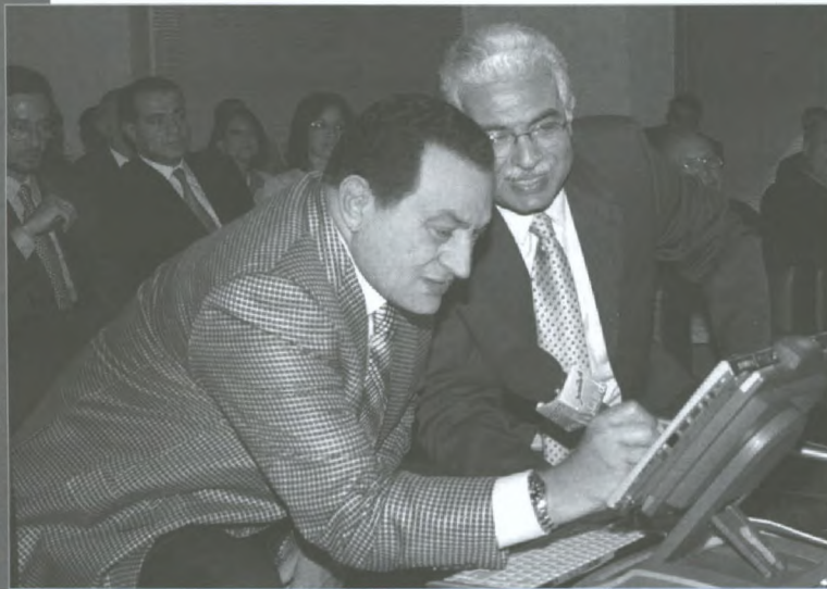
Government of Egypt

For more information on these business opportunities, turn to pages 4, 5 and 6.