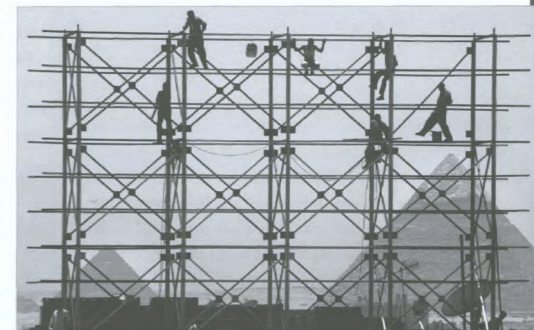
Egyptian workers put up a billboard in front of the pyramids of Giza. Egypt has undergone a series of economic and political reforms that many have said are long overdue.

Egypt's progress to date has improved its profile in international capital markets. As a result, foreign direct investment (FDI) and inward portfolio flows have risen sharply. Investment firm J.P. Morgan also noted Egypt's improvement in an investment climate study, which states that FDI is expected to reach $5.5 billion in 2006. Egypt's stock market is also the most active in the region and was the top performer in 2005.