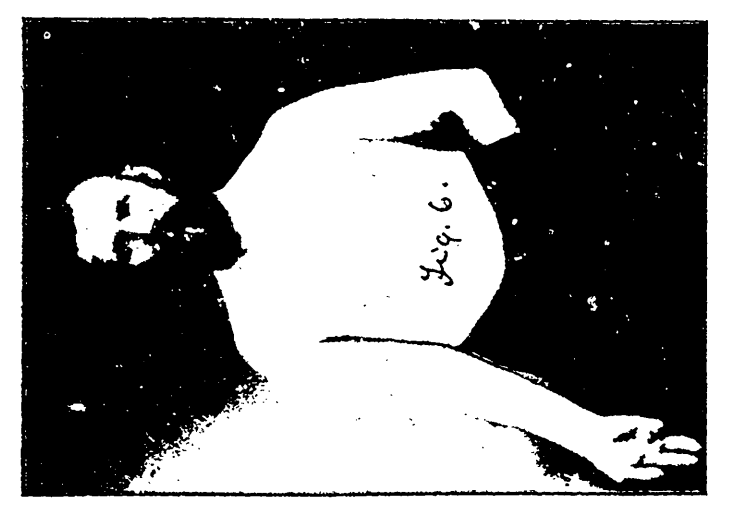
place. In this way valuable time was lost. However, at the end of five weeks, the patient returned home with a considerable degree of movement at the elbow. He could touch the end of his nose with his finger, and could extend the forearm fully two-thirds of the way to the carrying angle, while pronation and