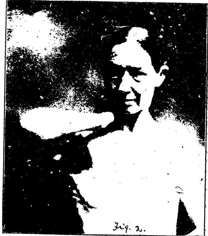
Case 2.—Showing amount of movement at the end of ten weeks.