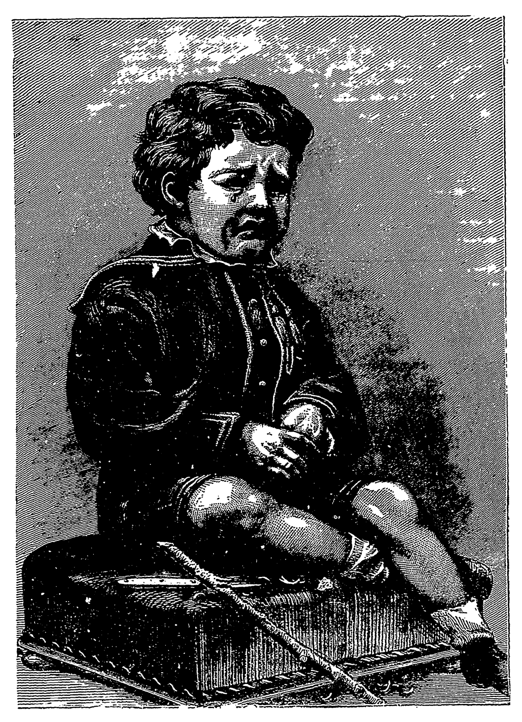
LEARN TO ENDURE .- (See next page.)