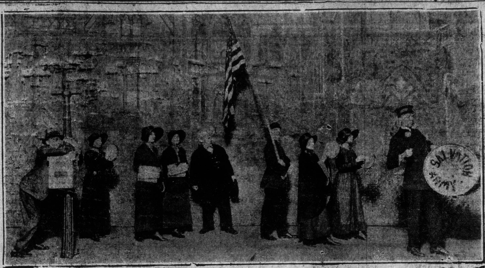
A SCENE FROM THE "OLD HOMESTEAD" AT THE GRAND OPERA HOUSE TONIGHT ONLY