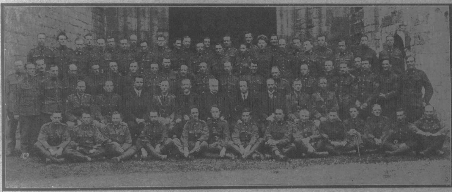
STUDENTS OF THE KHAKI THEOLOGICAL COLLEGE (For names see page 690.)

XVII. B. Special Cases. We now come to the difficult problem of the candidate who seeks ad-