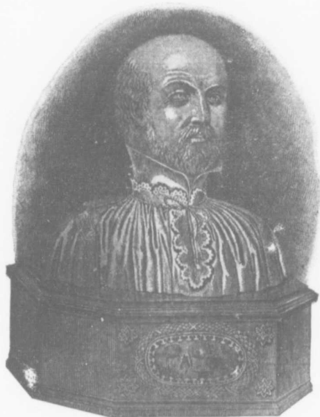
FATHER DE BREBOEUF