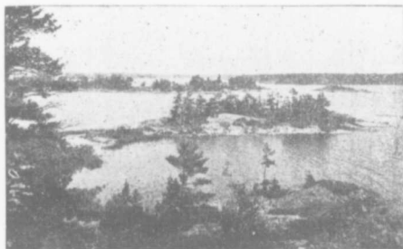
GEORGIAN BAY ISLANDS ADJACENT TO PENETANGUISHENE

The Parish and the present Church of Penetanguishene, old Touagainchain's village and a residence of De Breboeuf, are popularly known as the Jesuit Memorial Church and Parish. The name is well applied ; for the banks of the Penetanguishene Bay have seen the birth of both the Old and New Missions ; on them, Le Caron, Breboeuf and their companions landed and erected the first Chapel. Since the dispersion of the Huron nation, Penetanguishene having been the first settlement, the first port established in the former Huron Country, the seat of the first Church, the residence of the first priest who for many years used to attend the whole district from the Narrows of Lake Simcoe to Owen Sound, forms the connecting link between the past and present. The old mission seems to have continued, or at least was first revived in Penetanguishene, which has thus become the heir and representative of the past.