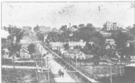
VIEW OF PENETANGUISHENE TAKEN FROM COPELAND'S MILL

There are in every country places which, on account of the events that transpired in them and their neighborhood, and also out of the traditions of the past which centre around them, offer a special interest to the student of history and the antiquarian.