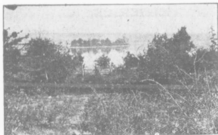
MAGAZINE ISLAND TAKEN FROM EASTERN SHORE