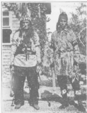
INDIANS OF TODAY

After the destruction of the Huron Missions, 1650, and the dispersion of the Hurons, the country remained uninhabited, except by an odd Iroquois here and there, until the beginning of the nineteenth century, 1827, when properly speaking, the missions of Penetanguishene begin.