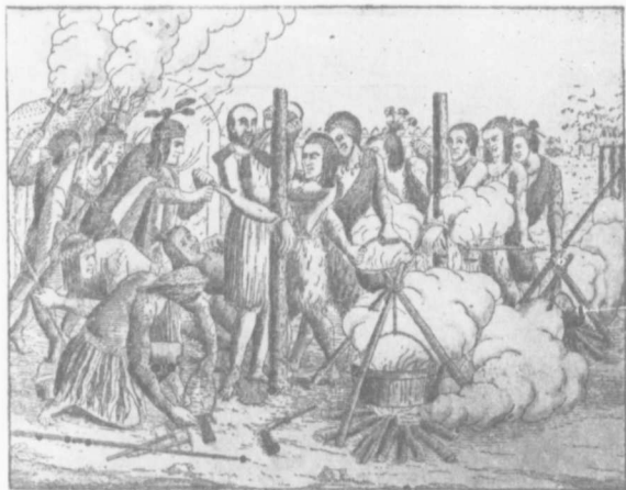
MARTYRDUM OF BREBROEUF

In 1634, the Fort Ste. Marie, on the river Wye, near Midland, became the headquarters of the missionaries, who for fourteen years labored among the Indian tribes. Out of the twenty-nine missionary priests who worked in Huronia, eight suffered death at the hands of the enemies.