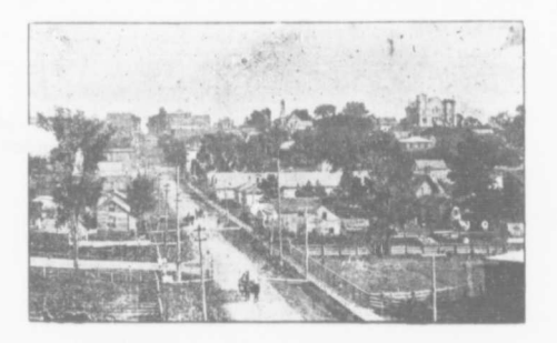
VIEW OF PENETANGUISHENE TAKEN FROM COPELAND'S MILL

There are in every country places which, on account of the events that transpired in them and their neighborhood, and also out of the traditions of the past which centre around them, offer a special interest to the student of history and the antiquarian.