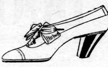
Patent Silver Calf Blucher Oxford, McKay Welt Soles, $1.78

Your only chance of missing a bargain is to stay away. Come with the hundreds of others and swell the throng of pleased buyers.