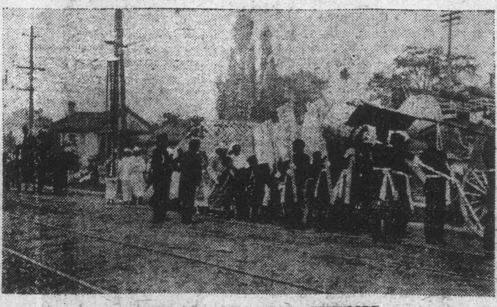
FUNERAL OF LEE CHEONG.

The last authentic word regardin records were cached at Etah.