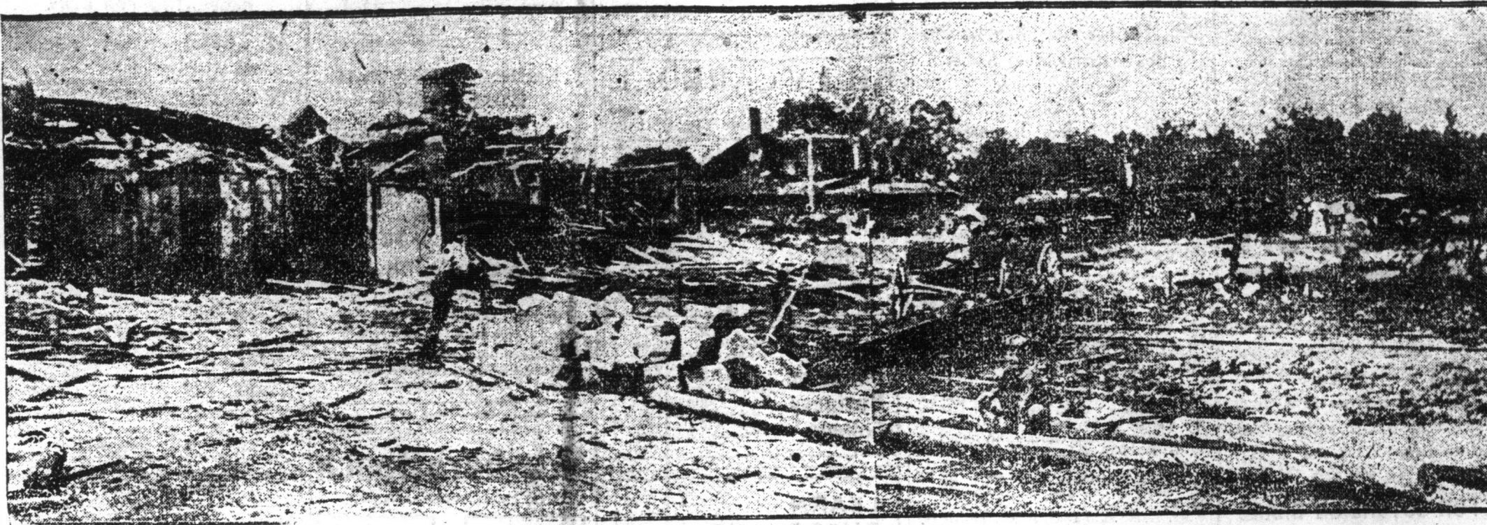
THE EXPLOSION AT ESSEX—Scene in the Railway Yards, Showing the Wrecked Buildings in the Vicinity.