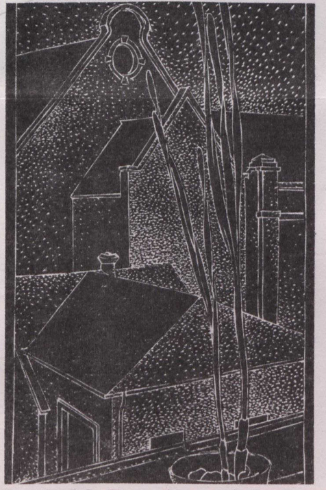
Card by L.L. Fitzgerald; partial view.