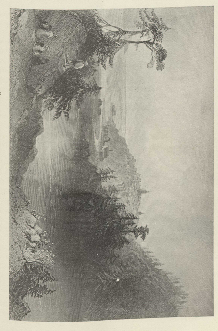
LILY LAKE IN 1840, SHOWING A PORTION OF THE CITY IN THE DISTANCE.