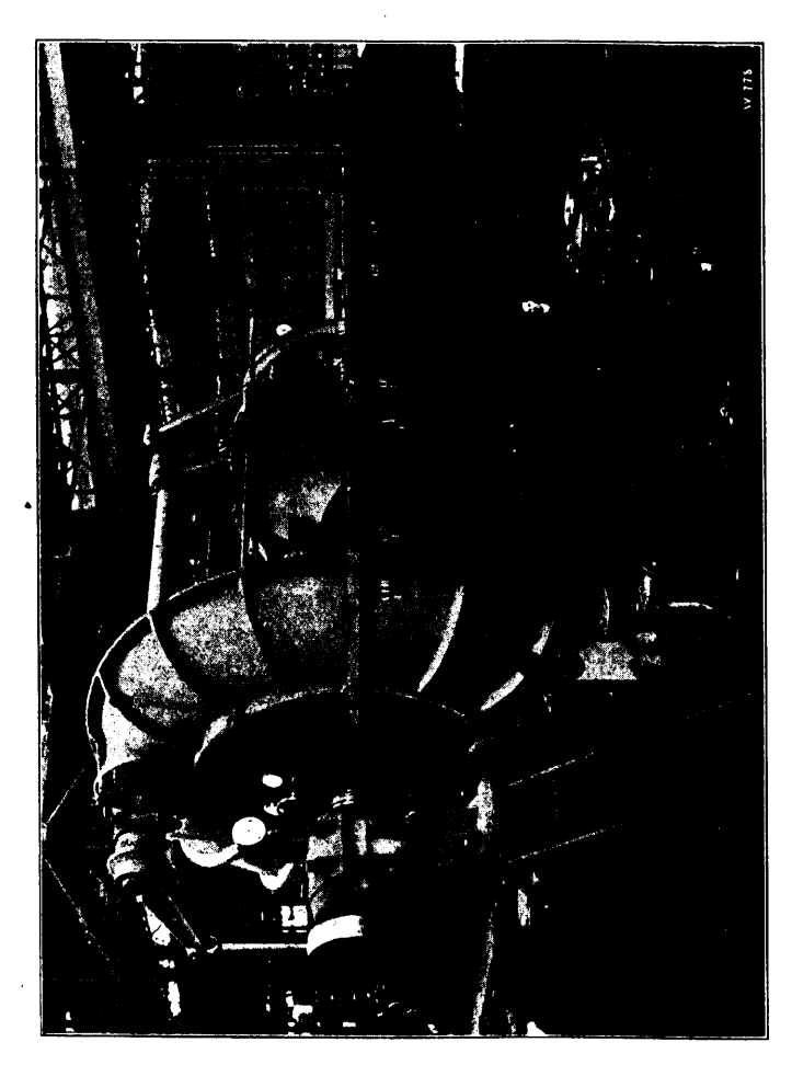
13,500 H. P. Turbine in course of erection for W. C. P. Co.