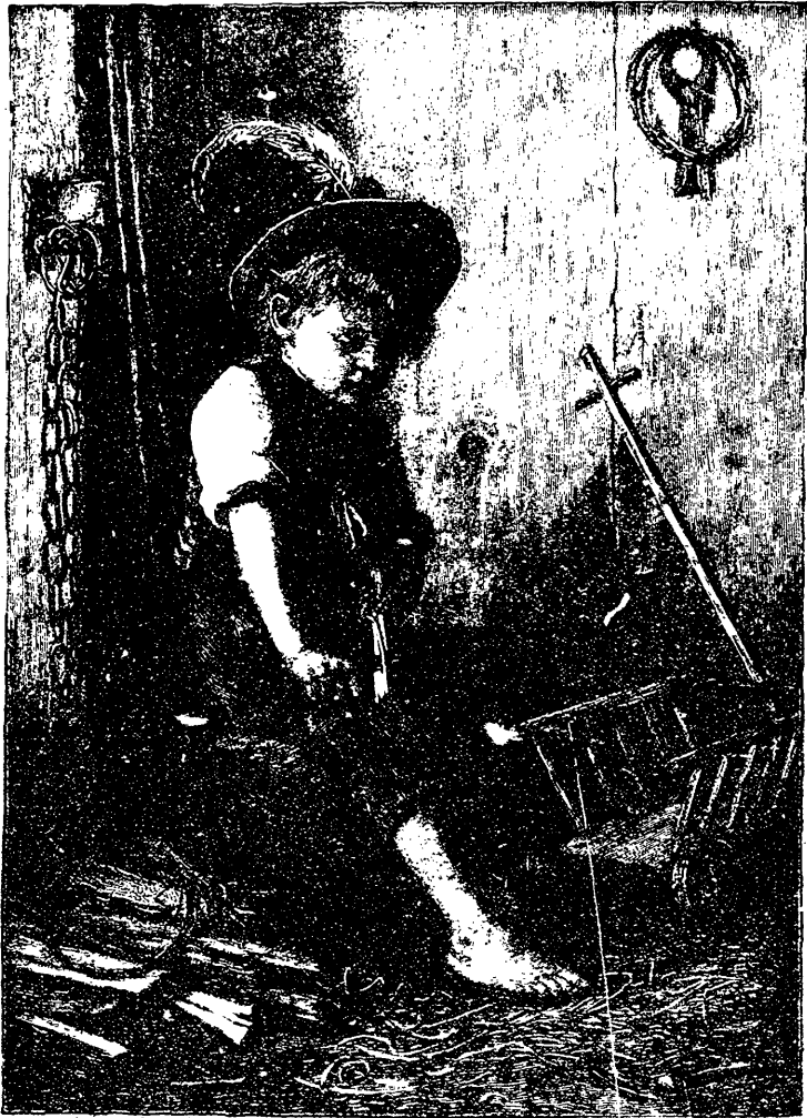
THE LITTLE CARPENTER—(see previous page).