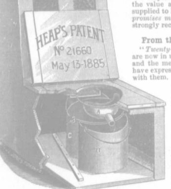
Inodorous Portable Bedroom Commode.

"Rawdon College, near Leeds, May 21,' 85, Dear Sir,—You will probably remember that two years sgo you supplied us with Earth Closets in connection with a partial re-modelling of our entire sanitary arrangepdorous Portable Bedroom Commode. A, the Urine Separator; B, Urine Receptacle; C, Excrement Pall. The result of the change then made has been altogether satisfactory, and we have resolved to complete the conversion of our system from Water to Dry Earth Closets. I shall be glad to have the order completed at your earliest convenience. I am. yours faithfulle. To the change then made has been altogether satisfactory and we have resolved the convenience. I am. yours faithfulle. To the change then made has been altogether satisfactory, and we have resolved to complete the conversion. ments. The result of the change then made