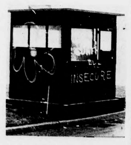
Flower Power for insecure security staff.

The two officer drippily drove off after failing to find the waterheavers.