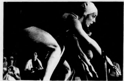
'This is terrible. Now we have to use the pool all the hours that it's open, or they'll close it and let the fish back in.'