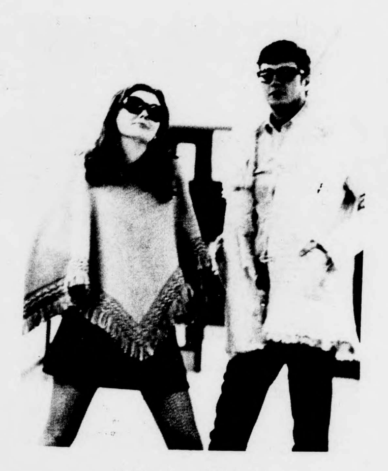
Oh Cisco!...oh, Poncho!...