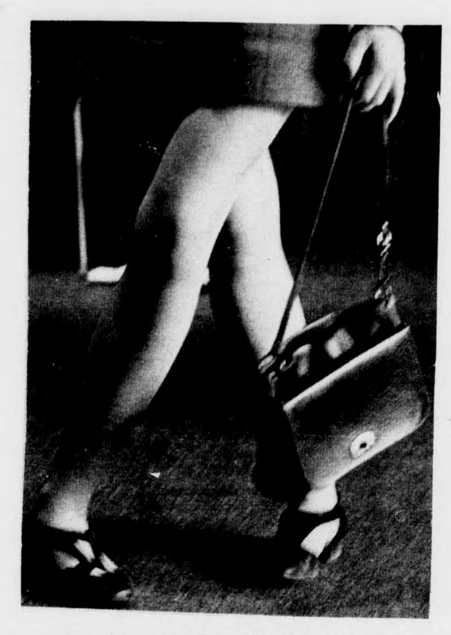
Is my portrait going to be in Excalibur?