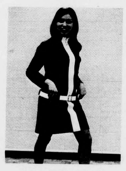
Oh you gypsy savage!

in hacked-up sweatshirts and grubby jeans, accessorized with fruit boots (the exception being those suave, debonaire biz boys, of course). But the most prominent apparel of the men is hair--uncut haircuts, moustaches, and vestiges of hair on chins that are reminiscent of our primate ancestors.