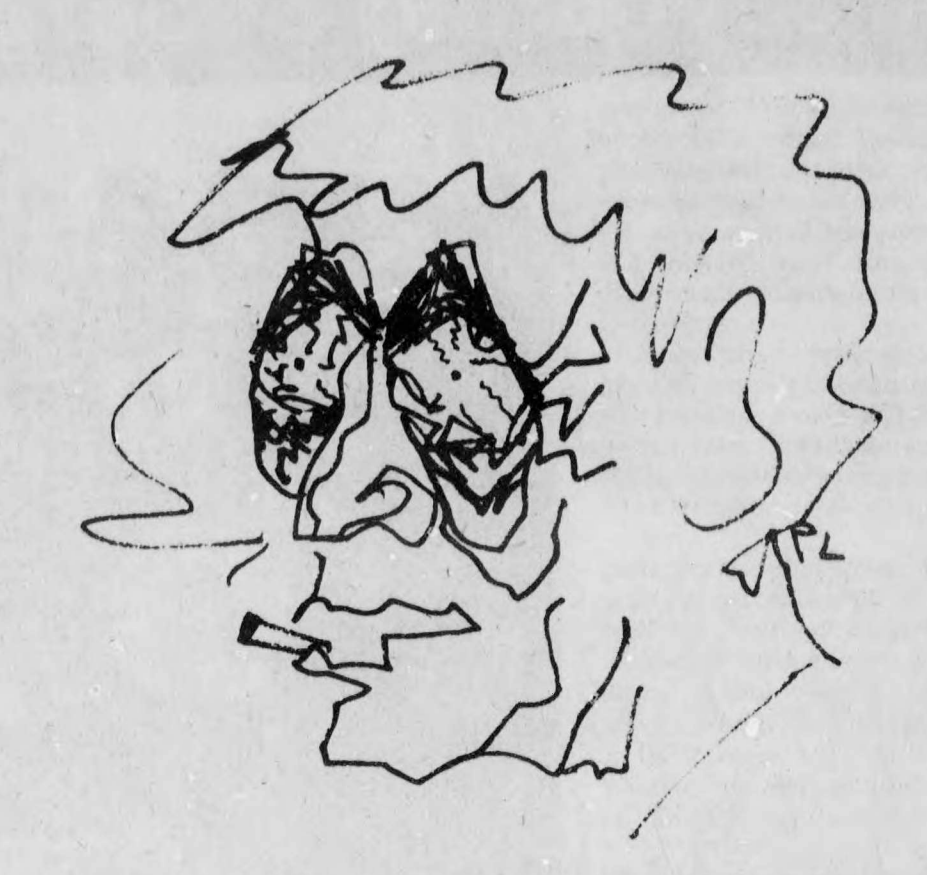
No, I think I'm going to classes. I could use some sleep.