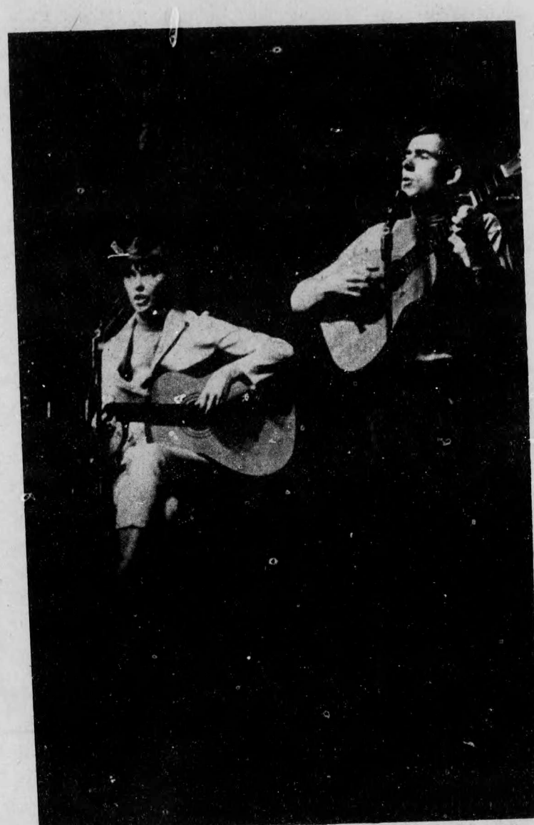
"... a unique presentation"