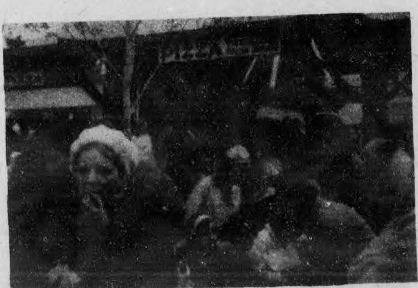
Patrons enjoying pizza on Expo grounds