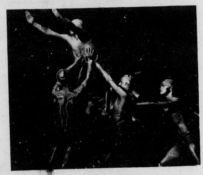
. . bronze statues do not move."