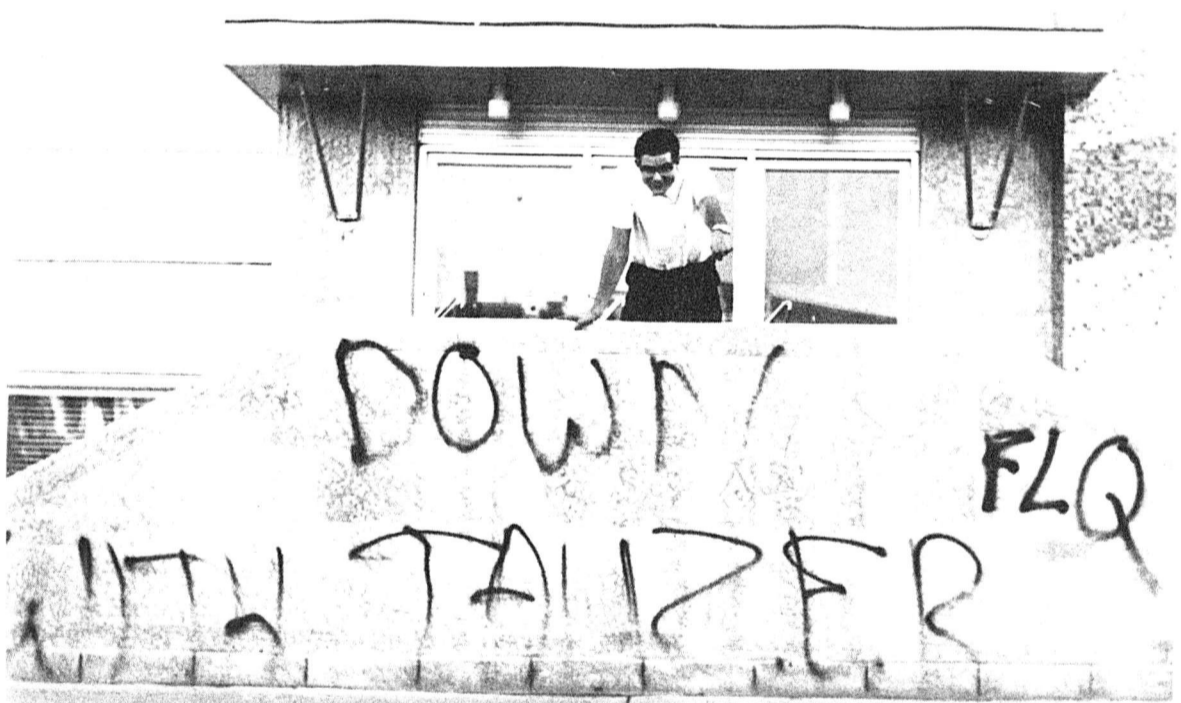
VANDALS PAINT THE TOWN BLACK . . . Engineering Building, parking lot renovated