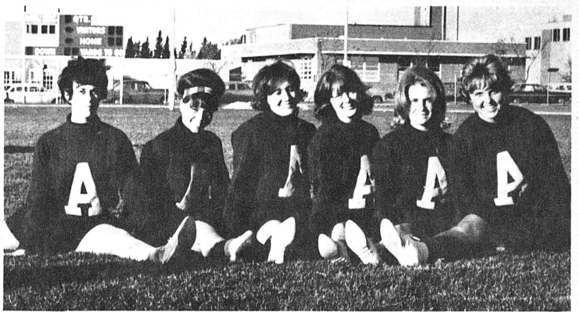
CHEERLEADERS PREP FOR GALA FOOTBALL WEEKEND

The men's golf team will begin the competition on Oct. 16 at 1:00 p.m., and continue on Oct. 17 at 9:00 a.m. at the Highlands Golf Course.