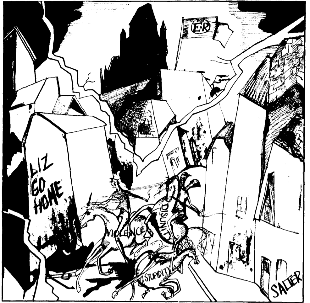
"COMMEMORATION OF CONFEDERATION - QUEBEC 1964"

Could it be that some are just too short-sighted to realize that their very existence will depend on unification?