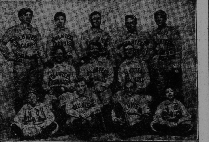
THE SPIT BALL PITCHER'S LAY.