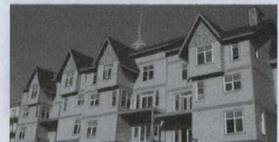
The before and after view of BPA Group's light steel frame houses in Dalian, China.