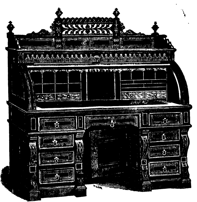
No. 1 Cylinder Desk. OVER 100 STYLES OF DESKS.