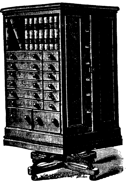
LEGAL Revolving Bookcase.