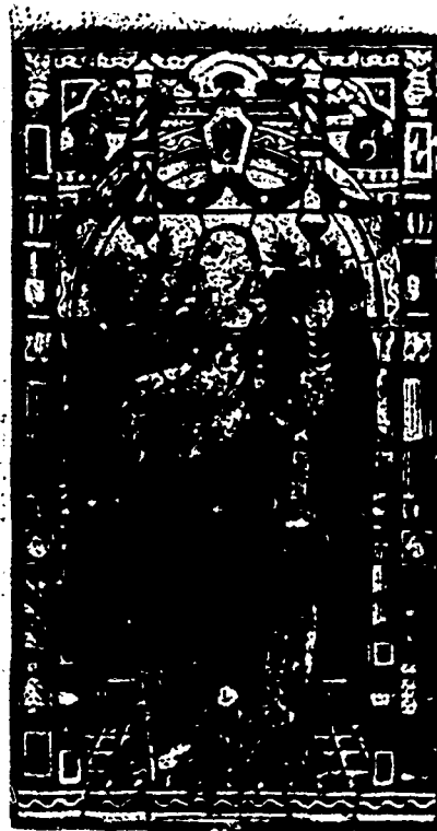
Photo Engraving of part of window in Main stairway of Court House, Winnipeg. Manufactured by BELL & CO.