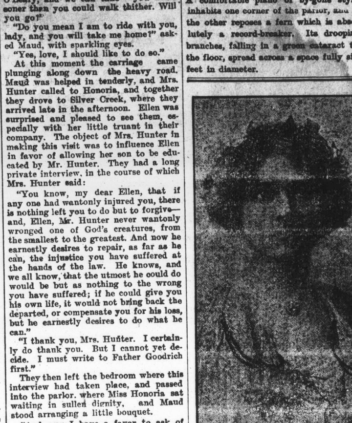
ELLEN BEACH YAW.

inhabits one corner of the parior, and in the other reposes a fern which is absolutely a record-breaker. Its drooping branches, falling in a green cataract to the floor, spread across a space fully six feet in allegations. feet in diameter.