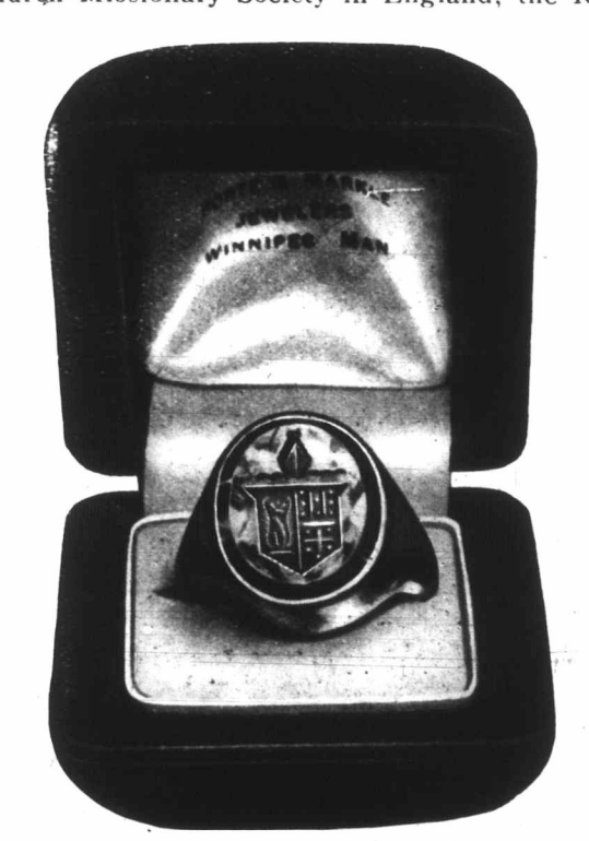
Cut of Episcopal Ring,

St. John's College.—On the nomination of the Church Missionary Society in England, the Rev.