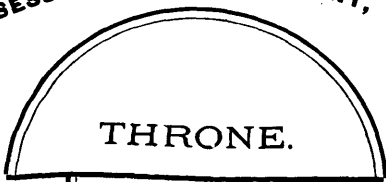
DIAGRAM OF THE SENATE CHAMBER. 2ND SESSION, 8TH PARLIAMENT, 1897.