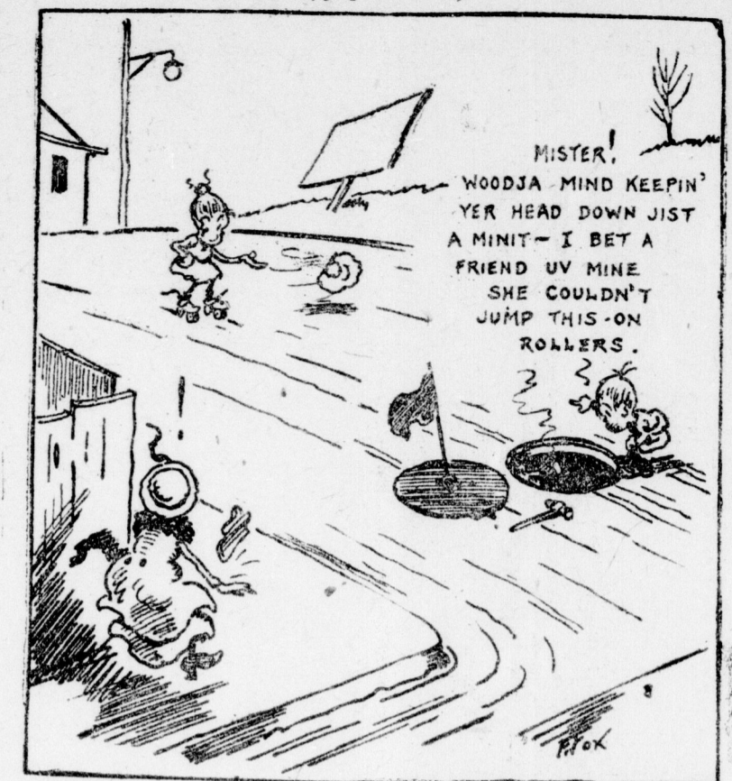
If her mother hadn't come along just at the wrong time Tomboy Taylor would have won two cents as easy as anything.