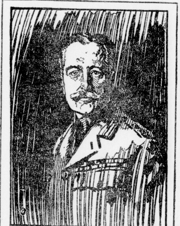
Field-Marshal SIR DOUGLAS HAIG

Beautifully reproduced, the work of famous artists inspired by the greatest war in history, these pictures cannot be supplied except in the March issue of Pictorial Review. Secure your copy of this big issue today.