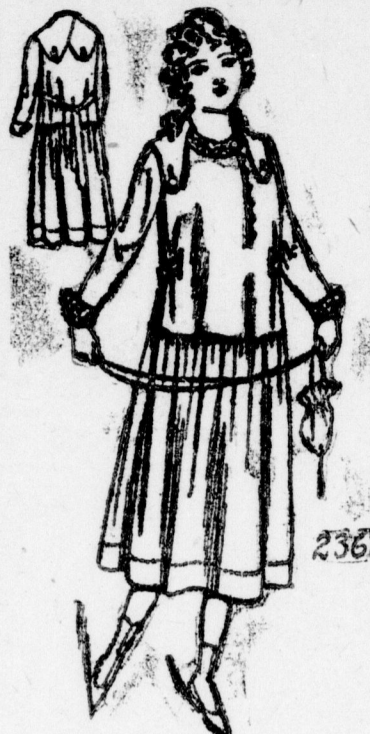
A STYLE VERY BECOMING TO GROWING GIRL. 2367—Black satin with braid trimmings, navy blue charmeuse with flaps of white satin, brown serge with pipings of burnt orange, or green gabardine with trimming of tan fallow, would be nice for this model.