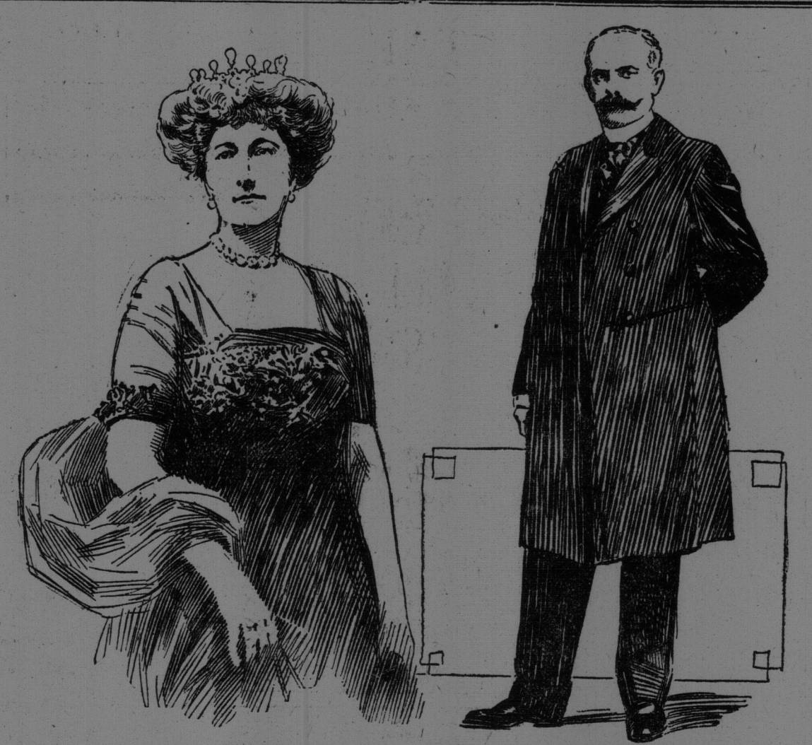
PRINCESS CLEMENCE. From a photograph just taken.

is the force that keeps the nerves well poised and controls firm, strong muscles. Men and women who do the world's work should guard their brains with Scott's Emulsion.