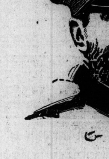
GRAND DUKE VLADIMIR, Commander of Troops at St. Petersburg.