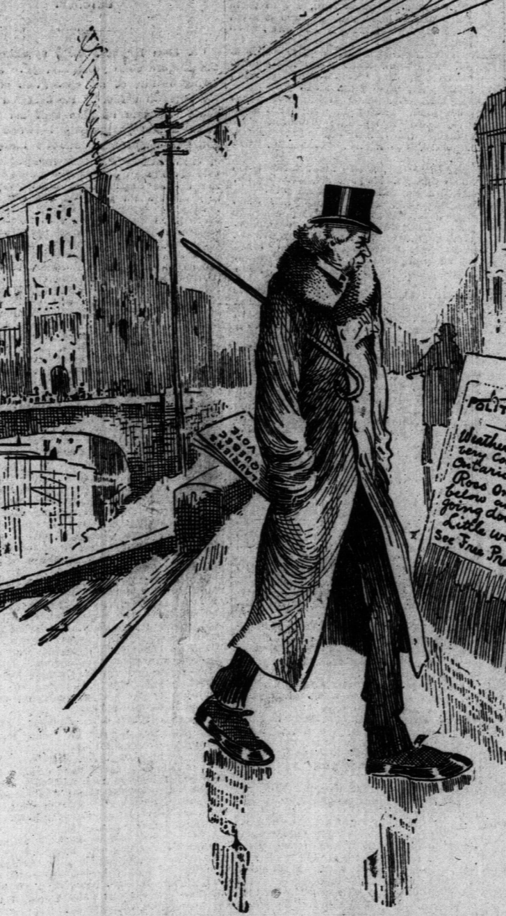
SIR WELLES: Dear me, one cannot be too thankful that one lives in a warm province like Quebec.