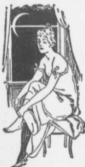
THE DIRECTIONS SAY

The Dr. Williams' Medicine Co., Brockville, Ont.