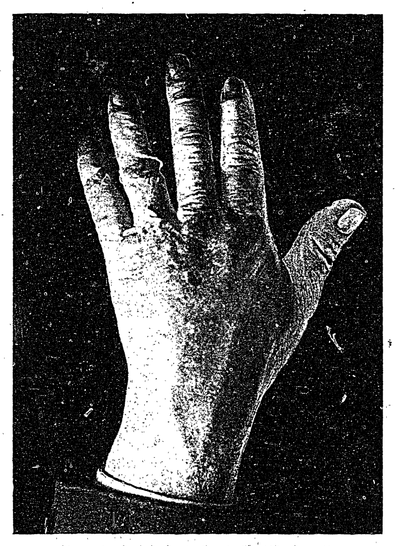
Photograph of hand, showing shedding of nails and blistering of skin.