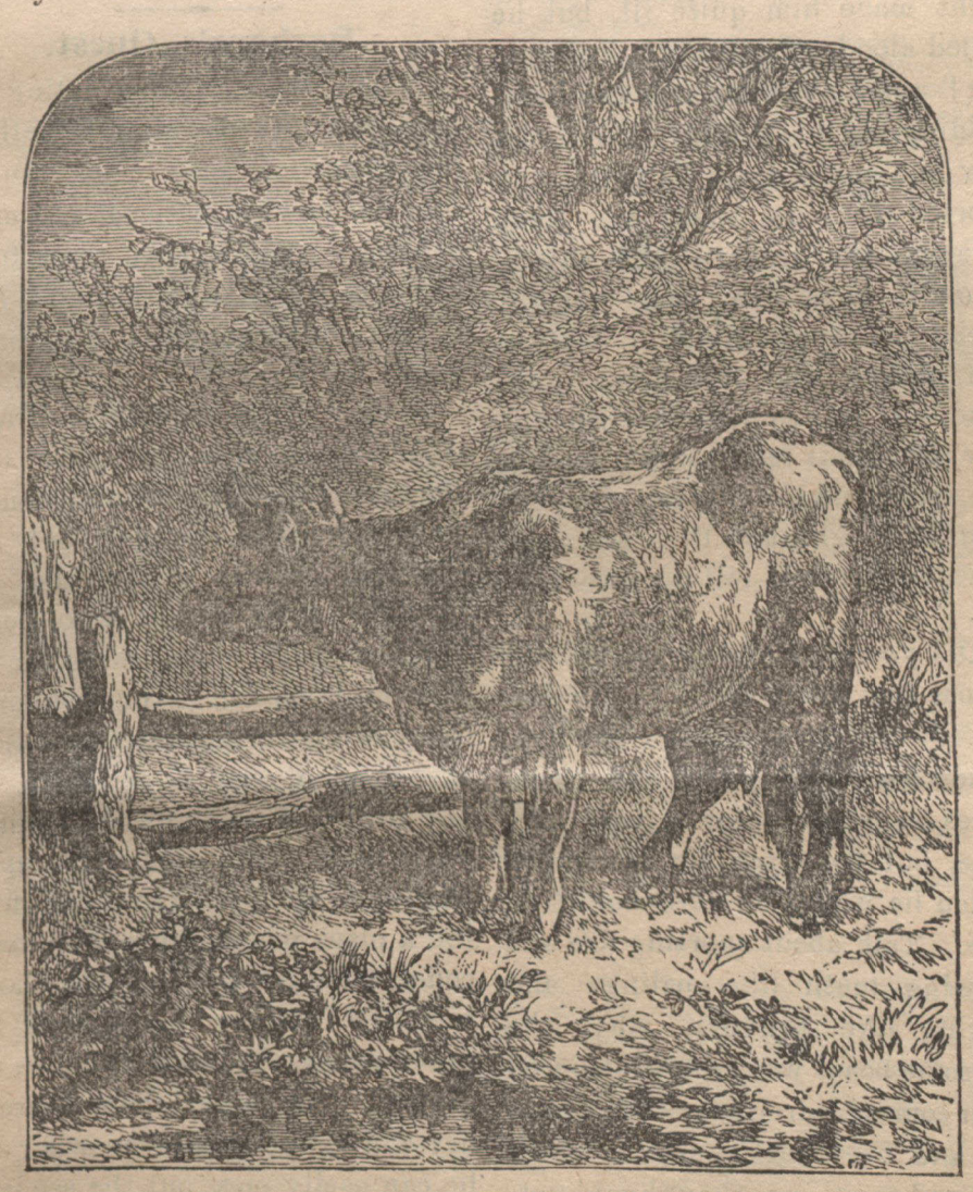
I WILL EAT THE SWEET GRASS

Mew, mew! What can I do For my little girl of three? I will catch all the mice, And they shall not come twice To the cake, you'll see;