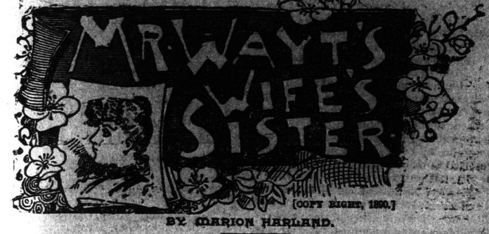
BY MERRILL HARRARD