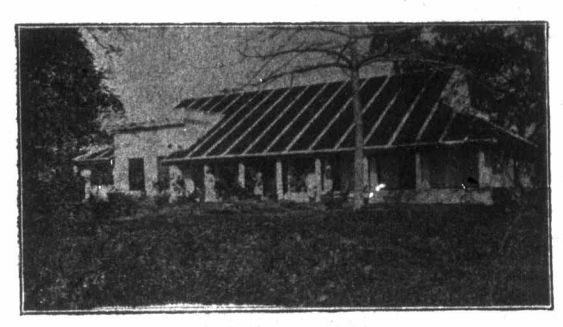
Ladies' Bungalow, Waltair:

alphabet. I studied about three and shalf hours each morning, and two or two and a half each afternoon. Hungry? Well, meals couldn't come too often for me those days while I still had my sea-appetite. The new fruits I enjoyed very much, and the rice and curry breakfast I adopted at once, and have never given up. It isn't a bit easier than it sounds to sit all day drumming away at Telugu. Sometimes one gets very restless, and then it takes all the stick-to-titveness one can summon up. I was fortunate in living in Waltair, where we had many