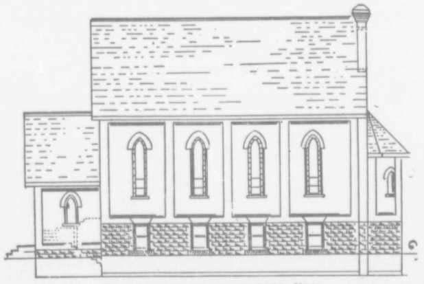
THE CHURCH AS IT APPEARS NOW