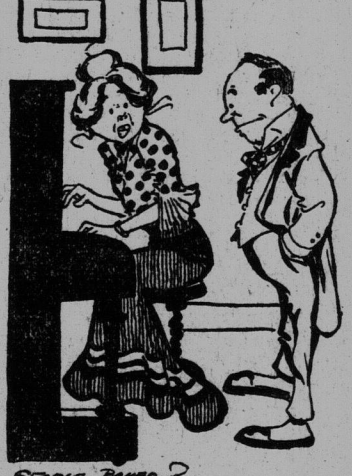
Mrs. Skrappe—A storm coming, eh? Well, if I throw this plate at your head you'll think there's a storm coming. Skrappe—No; not a storm, it will be just a little overcast that's all.

NOT MUCH OF A GENTLEMAN. Jones—If you keep on abusing me is never too old to learn. I think I'll study astronomy. Mrs. Weakleigh—A man is never too old to learn. I think I'll study astronomy. Mrs. Weakleigh—Job, you'll have to find a better excuse than that for staying out nights!