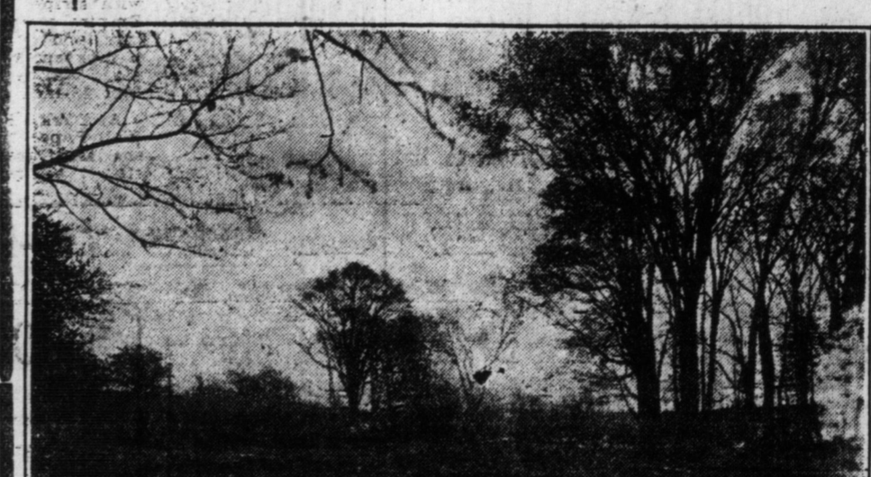
Ravine in Alexandra Gardens which has been laid out for park purposes

So sure are the owners of Alexandra Gardens that this property will increase in value that they are prepared to extend very liberal terms to a limited number of purchasers of lots who desire advances to enable them to build homes.