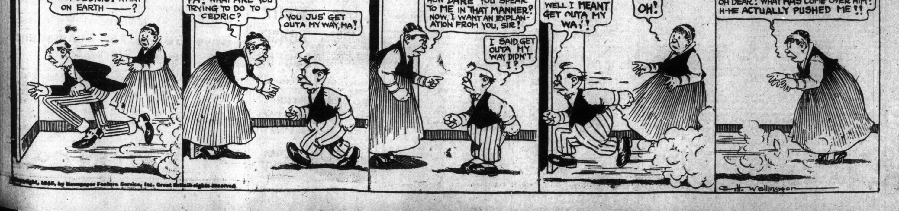
Copyright, 1915, by Newspaper Feature Service, Inc. Great British Rights Reserved.