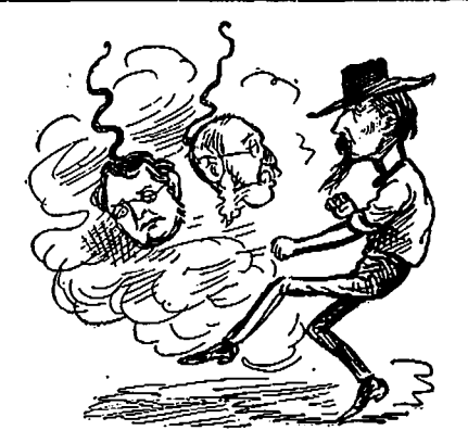
GIVE 'EM MORE !

The Grits have displayed their customary stupidity in neglecting to take up the Chinese question.* * Yet the pig-headed Grit leaders have been blind to the splendid opportunity afforded them.* * But Blake, Cartwright, Mackenzie and the rest of the purblind Grit politicians, whom some people call statesmen, could not see it.* * If these pretentious imbeeiles, who throw away opportunities in this fashion, ever attain power it will be owing to hucky accident.—Daily News III.